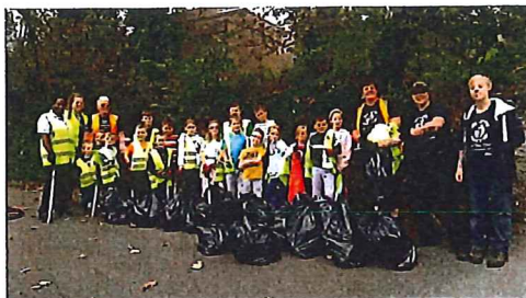
Clean Our Patch — Plymouth

Clean Our Patch was founded under the mentality of being proactive about an issue that our local council does not have the capacity to achieve. It was vital to ensure full accessibility to all. So in January 2019, we created our ambassador programme giving people in their local neighbourhoods access to organise and lead monthly litter picks.