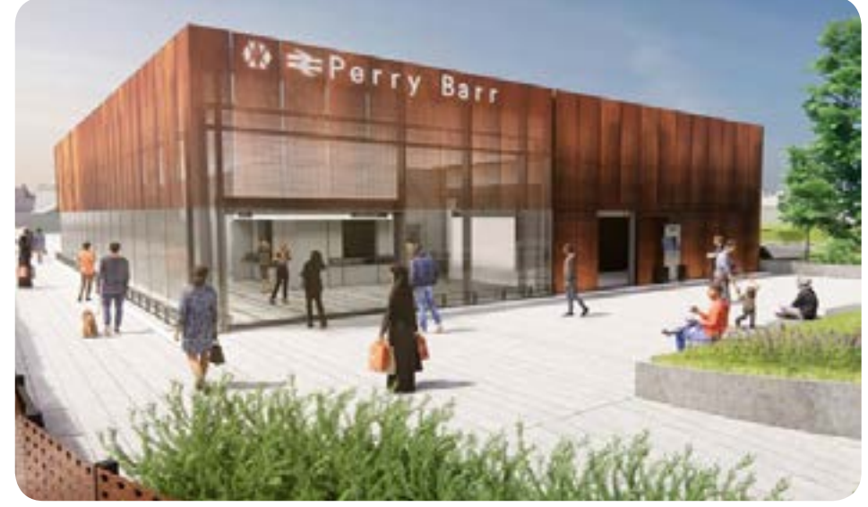
How the new Perry Barr station will look following the rebuilding work