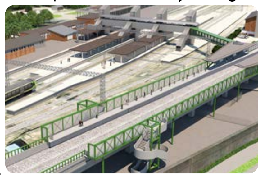
How the new Bletchley station might look.

The consultation is now open and runs until Wednesday 9 June 2021 - to have your say on the proposals, log onto the East West Rail website at www.eastwestrail.co.uk