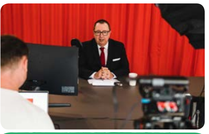
The stakeholder confence will take place on May 19.

Invitations have been issued to our mailing list, or to request a place simply email corporate.affairs@wmtrains.co.uk