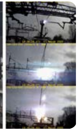
A London Northwestern Railway Class 350 carried out testing.