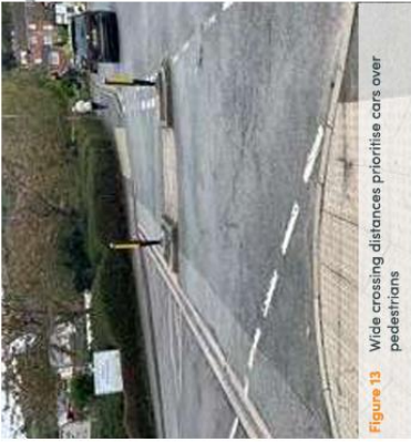
Figure 13 Wide crossing distances prioritise cars over pedestrians