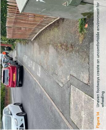
Figure 14 Uneven footways create an uncomfortable environment for wheeling