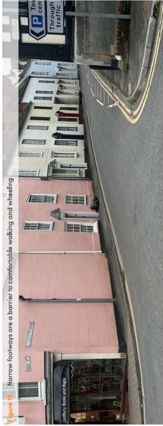
Figure 15 Narrow footways are a barrier to comfortable walking and wheeling