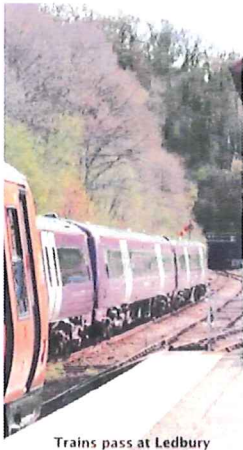
Trains pass at Ledbury