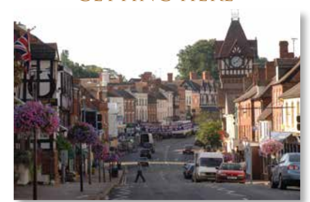
Ledbury is a Herefordshire market town, lying east of Hereford, and west of the Malvern Hills.