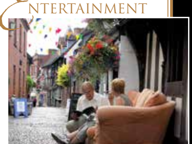
The Poetry Festival's 'Hospitality Suite'.