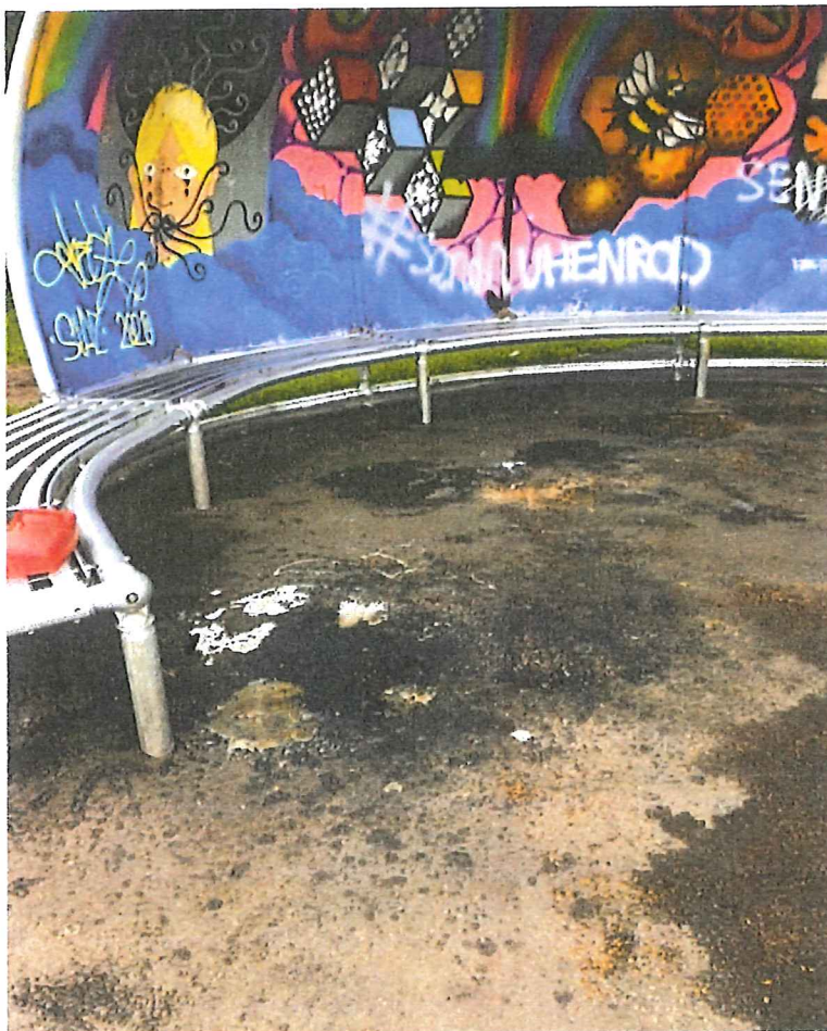
Damage from previous incidents, quotes are being sought for this repair work.